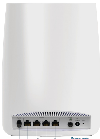
Sync Internet Gigabit Ethernet ports Power on/o